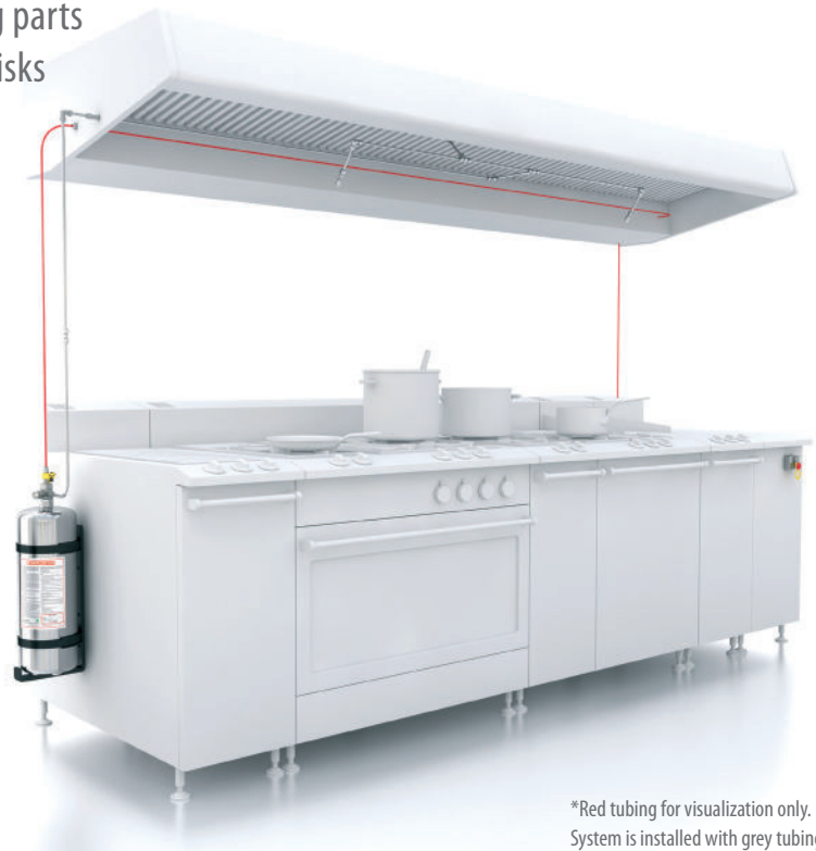
*Red tubing for visualization only. System is installed with grey tubing

LPCB Certified and Listed for Fixed Fire Extinguishing Systems for Catering Equipment. Tested for quality, Safety and Performance according to LPS 1223, Issue 2.3.