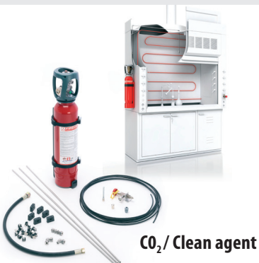
FUME CABINET SYSTEMS