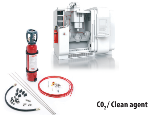
CNC MACHINE SYSTEMS