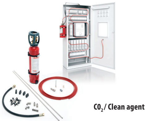
ELECTRICAL CABINET SYSTEMS