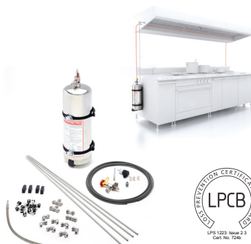
COMMERCIAL KITCHEN SYSTEMS